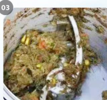
High efficiency dehydration